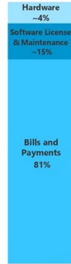
Services & Products